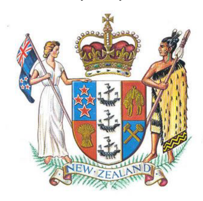
The 1850 Colonial Seal shows a settler and Māori:

The New Zealand coat of arms shows a partnership between the Crown and Māori: