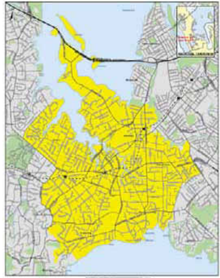
Legend --- Boundary 1:10k --- Actual Road 2:10k --- Major Road --- Public Open Space Whau Local Board 1:10,000