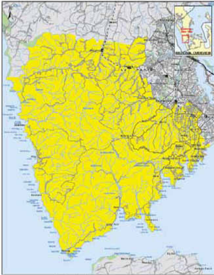
Legend --- Boundary 1:10k --- Actual Road 2:10k --- Major Road --- Public Open Space Waitakere Ranges Local Board 1:10,000